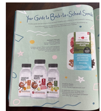
LEFT: Counter Sign w/Research URL/QR. TOP: Life Time Experience Life Magazine Full Page Ad. BOTTOM: Parent Sign-in Tabling Visual and Experience Life Magazine Back-To-School Guide Feature.

the samplingstore ™ LIFETIME HEALTHY WAY OF LIFE